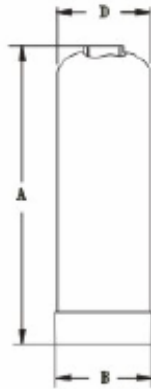
6"-16" Standard Base